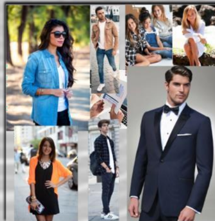
Designer Garments & Accessories