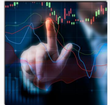
Trading & Outsourcing