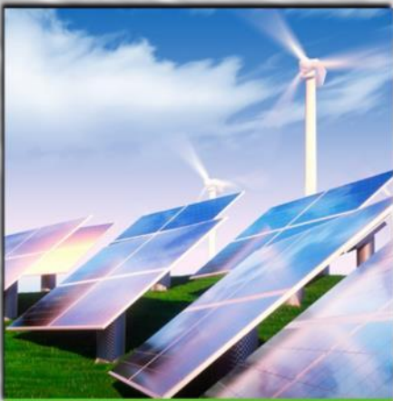
Solar Renewable Energy