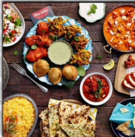
Food & Beverages